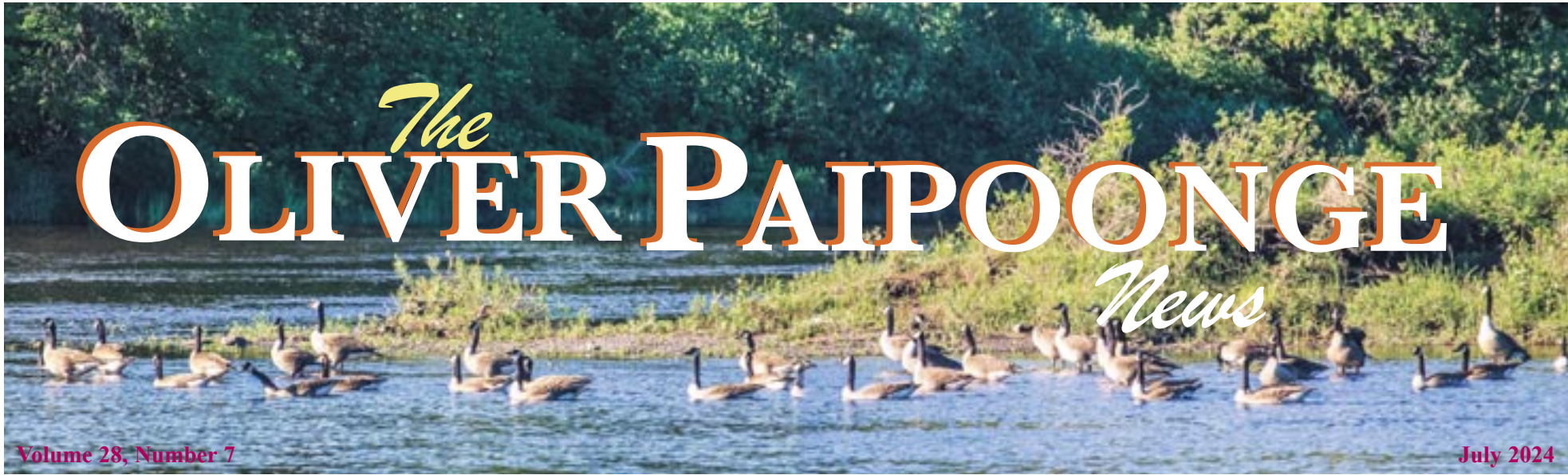
Looks like the Canada Geese are planning to spend the summer on the Kaministiquia River.